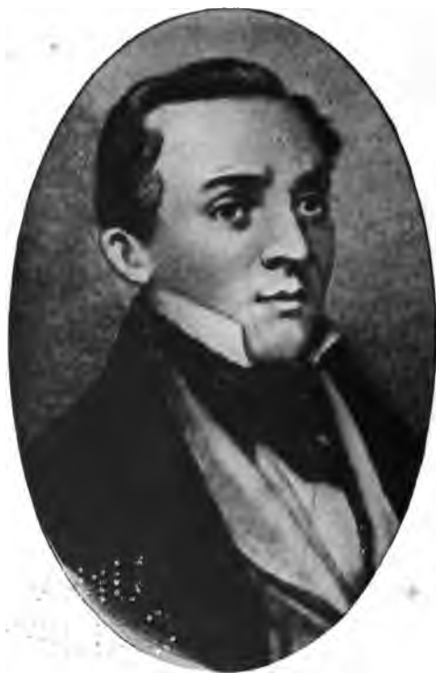
José María de Heredia